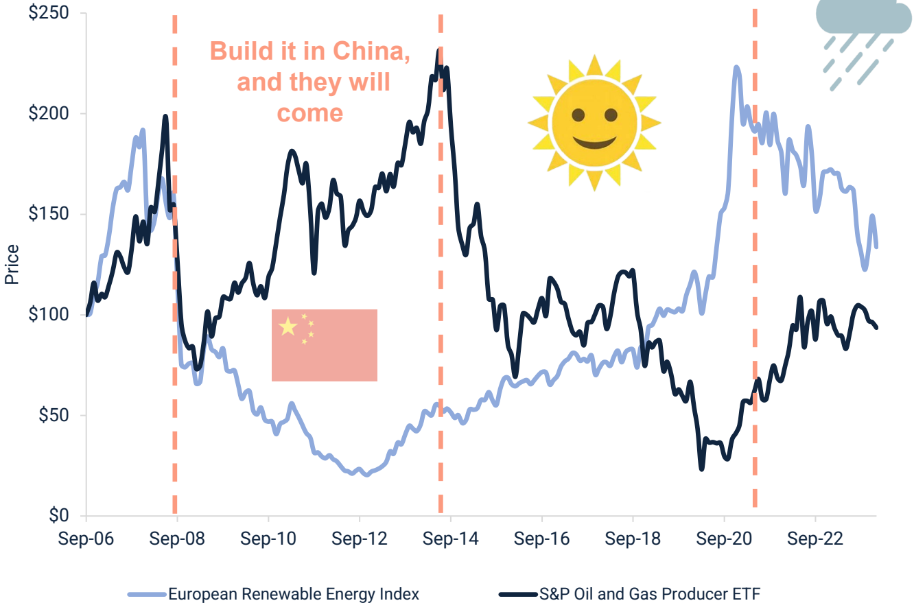
Normalized Equity Prices: ERIX vs. XOP