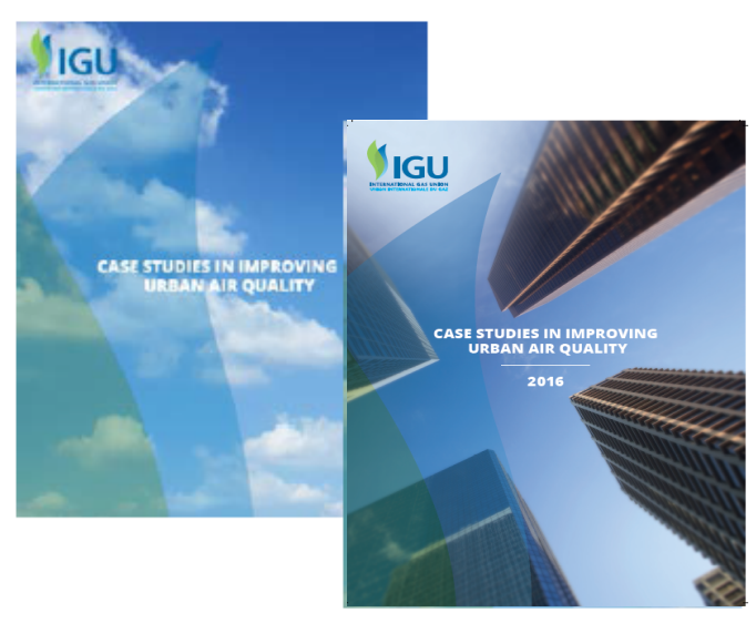
Case Studies in Improving Urban Air Quality 2015 & 2016 Editions