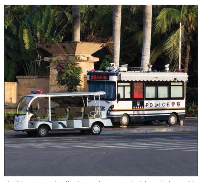
Electric armoured police bus and 8-seater electric car Hainan, China.

landscape together. Such dialogue also helps secure an energy future that remains affordable, productive, sustainable and fair to all.